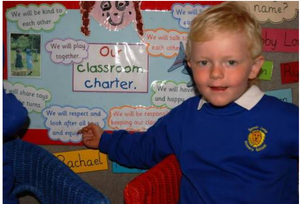
Learning about the UNCRC in an infant school in the UK. Displays serve as useful reminders