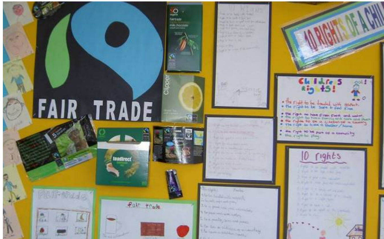
Display of children's work on Fair Trade at Kings Park Primary School, Bournemouth. The theme: Trade and rights and responsibilities