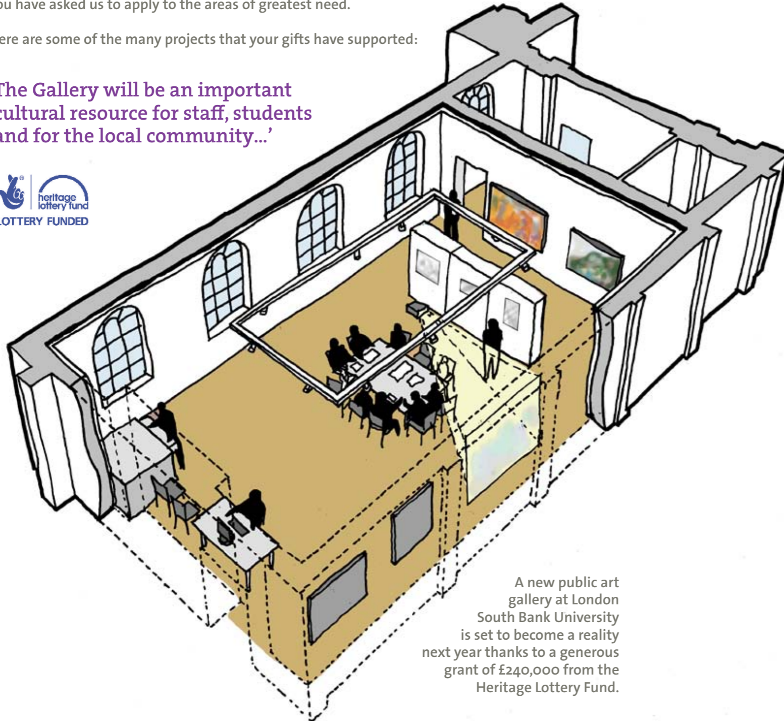
A new public art gallery at London South Bank University is set to become a reality next year thanks to a generous grant of £240,000 from the Heritage Lottery Fund.

The Gallery will be situated in the Borough Road Building and will be dedicated to a collection of works by influential British figurative artist, David Bomberg, who taught at the Borough Polytechnic during the 1940s and 1950s, and some of the artists that studied with him and who formed the Borough Group.