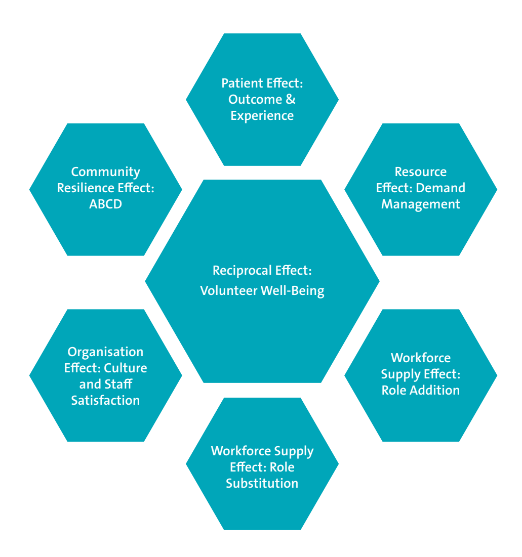
Figure 2. Seven Domains of Volunteer Effectiveness

We define effectiveness using a framework containing seven elements (Figure 2).